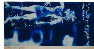
5. Robert Rauschenberg, Blueprint Portfolio II. Laid Out Body , ca. 1950. Cyanotype, 6 3/8 x 11 3/4 in. (16.2 x 29.8 cm). Robert Rauschenberg Foundation; © Robert Rauschenberg Foundation / Licensed by VAGA, New York, NY