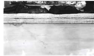
1. Robert Rauschenberg, Postcard Self-Portrait, Black Mountain (II) , 1952; gelatin silver print, 3 1/4 in. x 5 1/2 in. (8.26 cm x 13.97 cm); Collection SFMOMA, Purchase through a gift of Phyllis Wattis; © Robert Rauschenberg Foundation / Licensed by VAGA, New York, NY

2 The photograph's tour de force is its verticalization of the studio floor, which comes to resemble an abstract block of gray. Those few feet closest to the viewer lack focus (likely on account of the camera being placed on or very near to the floor), which only resolves in a narrow band just below the bottommost mattress, where one can make out what appear to be dust motes. A washy expanse of smudging, including possible traces of fingerprints, lightly stains the emulsion in the photograph's lower quadrant, lending the floor an additionally contradictory character, for it reads not only as both horizontal and vertical but also as both hard as cement and ever so slightly atmospheric, even liquid. Cover the top portion of the image and one could be looking at a reflection on shallow water, an effect Rauschenberg captured in another photograph, Untitled [Folly Beach, S.C.] (ca. 1952, fig. 2), which, incidentally, also retains visible smudging in its emulsion. 2