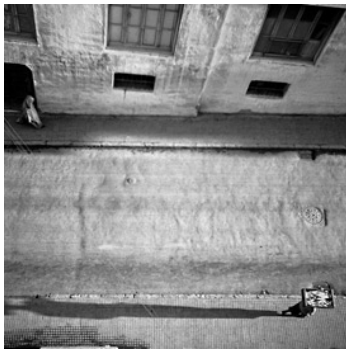
6. Robert Rauschenberg, Tangier Street (II), 1952. Gelatin silver print, 15 x 15 in. (38.1 x 38.1 cm).