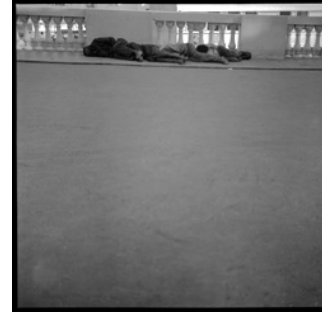
4. Robert Rauschenberg, Untitled, ca. 1952, printed ca. 1980. Contact print, 2 1/4 x 2 1/4 in. (5.7 x 5.7 cm). Robert Rauschenberg Foundation