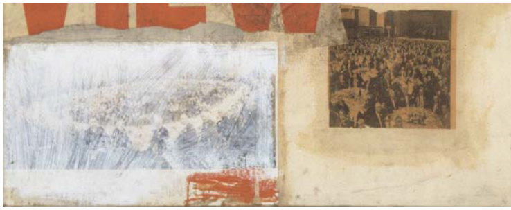
3. Robert Rauschenberg, Hazard , 1957 (detail). Oil, newspaper clippings, paper, plaster, and wood on canvas, 84 1/2 x 37 3/4 in. (214.5 x 95.6 cm). Ludwig Forum für Internationale Kunst, Aachen, Germany; © Robert Rauschenberg Foundation / Licensed by VAGA, New York, NY