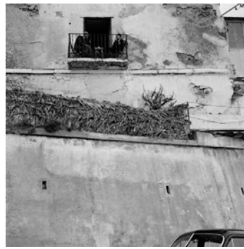
7. Robert Rauschenberg, Tangier, 1952. Gelatin silver print, 15 x 15 in. (38.1 x 38.1 cm).