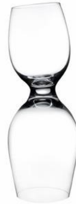
Red or White Wine Glasses, $140 (set of 2); Nude; glass

Designed by Ron Arad for Nude, the versatile Red or White Wine Glasses ($140, set of two) combine a simple, elegant silhouette with ingenious practicality. A slight bend in the stem is meant to evoke the way people lean closer at table to share a secret; a twist of the wrist switches from white to red service, depending on which side is up. Andrea Branzi's new Profile Vase ($65) in sheet metal and glass offers its own cheeky invitation to unleash artistic expression through floral design. San Francisco designer Max Gunawan's Mini Lumio+ ($125) has all the style of its full-size cousin with a more compact profile. The new portable light also features added functionality to power mobile devices and comes in three color options.