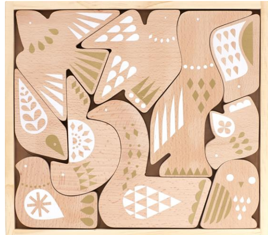
Deluxe Puzzle and Play, $49.95; Petit Collage; beech wood; photo: courtesy Petit Collage

For little ones on the shopping list, organic bird shapes that nest together in the Deluxe Puzzle and Play ($49.95) will delight small hands with natural beechwood heft; screen-printed with metallic gold and white accents, these locally made blocks add whimsy to any room décor. Polished wooden rings of the Modern Bunny Stacking Toy ($28) can be built in any order, and hop easily from nursery shelf to the playroom floor. For gamers of all ages, a new Solitaire Playing Card Set ($14) from San Francisco designer Susan Kare for Areaware features artwork that nods to the original Solitaire computer game and coincides with the 25th anniversary of its Windows 3.0 release.