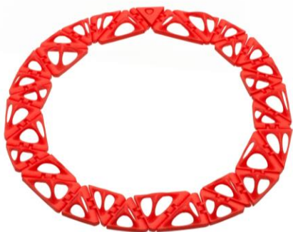
Tetra Kinematics Necklace, $95; Nervous System; nylon; photo: courtesy Nervous System

lesser known is his youth spent in Laguna Beach, which remains close to his heart. The deluxe monograph Wayne Thiebaud ($150; hardcover) features plates selected by the California artist himself and is the most comprehensive look at his work to date. From Cityzen designer Azin Valy's line of social-minded accessories, the printed-silk San Francisco Scarf ($180) honors the "City by the Bay" with a pattern inspired by aerial satellite views of the region, which the artist abstracted and colorized to create a stylish badge of city pride.