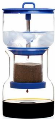
Cold Bruer, $80; Bruer; glass, stainless steel and silicone

Shoppers can also find gifts online at museumstore.sfmoma.org and at the Museum Store located inside San Francisco Airport’s international terminal (great for the holiday traveler’s last-minute needs)—all purchases support the museum as a vibrant cultural hub year-round. Along with museum gift memberships, below are just a few highlights from the Museum Store’s 2015 holiday assortment to help anyone practice the art of giving.