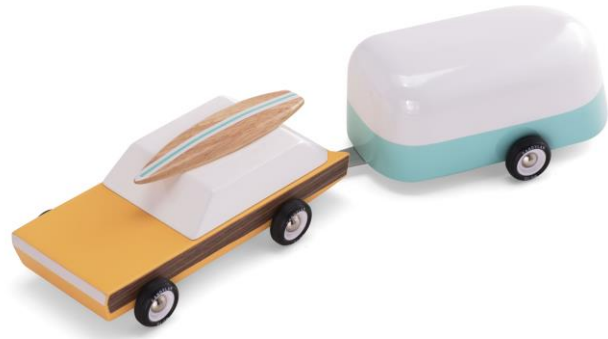
Woodie Wagon + Surfboard, $35, and Camper, $25; Candylab Toys; beech wood

Surfers big and small will be California dreaming with the Woodie Wagon + Surfboard ($35) . Featuring real walnut veneer-paneled sides, water-based paint and rubber tires, the toy car also comes with a magnet embedded in the roof to hold a surfboard securely in place all the way to the beach. Camper with magnetic hitch ( $25 ) sold separately. American painter Wayne Thiebaud is famous for his still lifes of pies and cakes, but perhaps