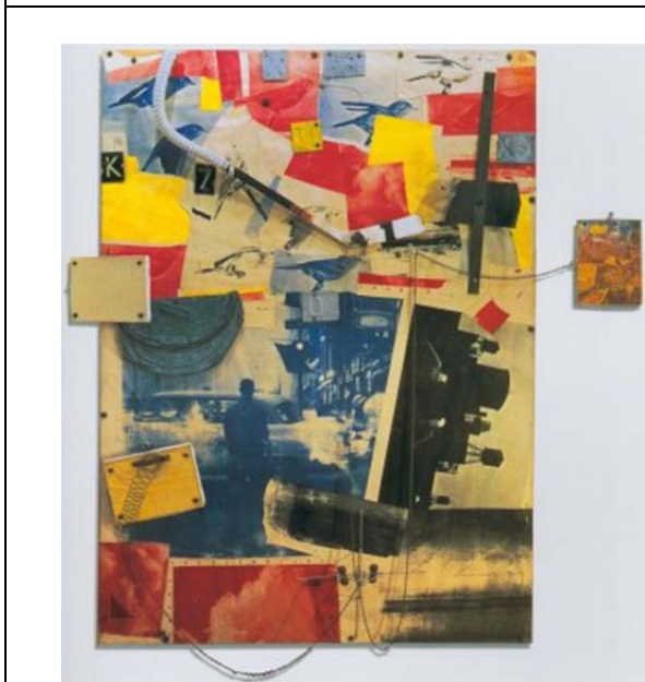
Robert Rauschenberg, N. Y. Bird Calls for Öyvind Fahlström , 1965. Silkscreened ink on cut-and-torn papers stapled to canvas and covered with Plexiglas, with hockey stick, hose, metal garbage-can lid, antenna, metal, spring, film canister, and chains, 93 x 82 x 11 in. (236.2 x 208.3 x 27.9 cm) installation variable. Private collection