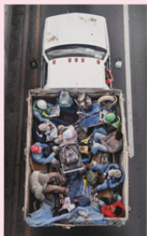
Alejandro Cartagena, Carpoolers #21 , from the series Carpoolers , 2011–12