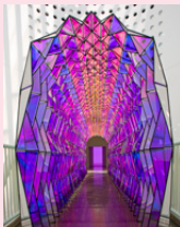
Olafur Eliasson, One-way colour tunnel , 2007