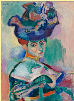
Henri Matisse, Femme au chapeau (Woman with a Hat), 1905