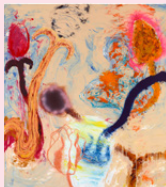
Dewey Crumpler, Tulip Memories III , 1995