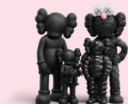
KAWS, FAMILY, 2021; © KAWS